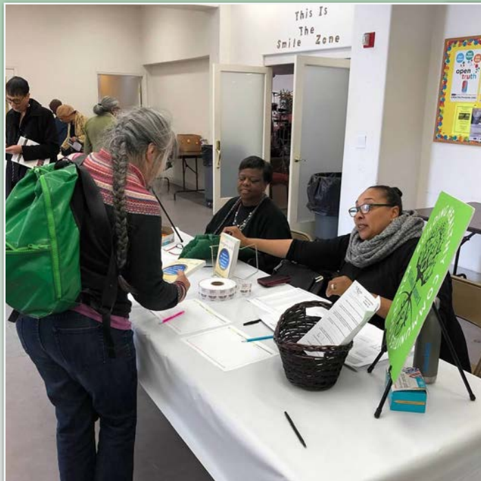
Campaign to Counter Childhood Adversity