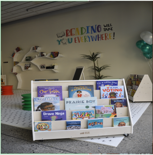
Grand opening of the Belva Davis Book Nook at Bayview Hill Gardens to help children embrace reading