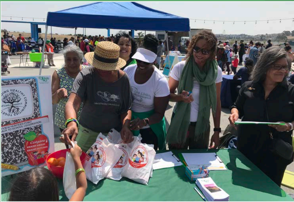
Promoting Health Education & Wellness