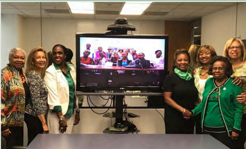
Black History Month celebration in partnership with NorcalMLK Foundation and Aquarium of the Bay