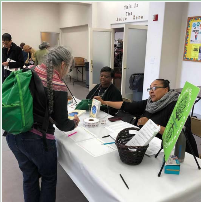
Black K.A.R.E. (Kidney Awareness, Resources & Education)