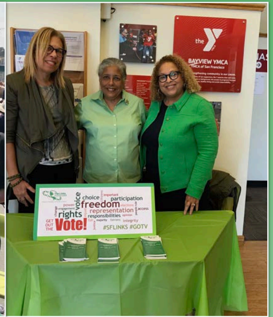
Voter Registration Outreach