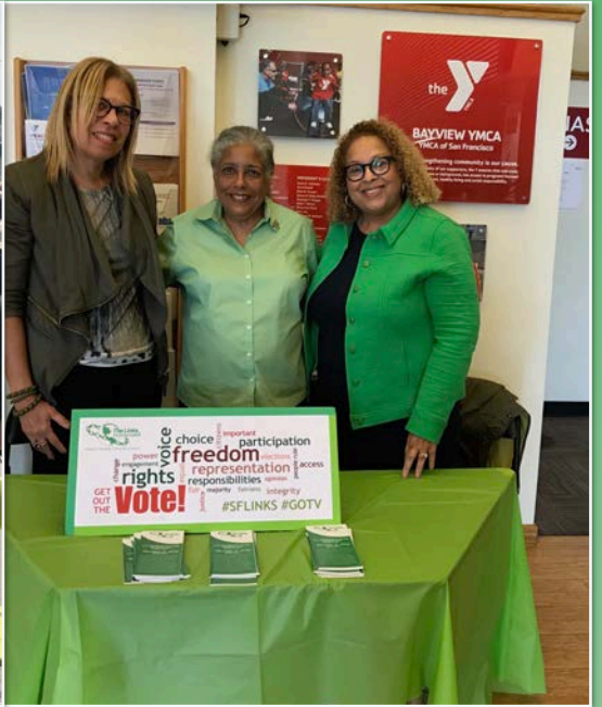
Voter Registration Outreach