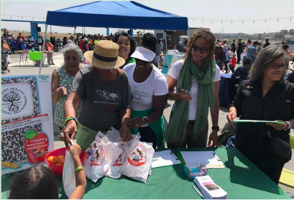
Promoting Health Education & Wellness